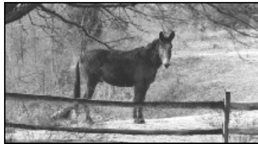
Say hello to "Janie" our mule

You'll see various fowl including: Muscovy ducks, Delaware chickens, Toulouse geese, Bourbon Red Turkeys, and even Guineas. Visitors enjoy our fluffy rabbits, friendly Toggenburg goats, woolly Dorset sheep, and muddy Yorkshire pigs. Our Milking Shorthorn cow "Bossy" and "Janie" the mule are favorites of many. Finally, we can take a wagon ride thanks to our Clydesdale Draft Horses .